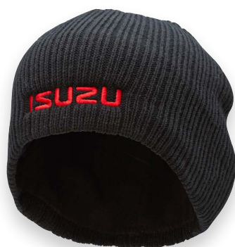
ISUZU CABLE KNIT BEANIE $18ea