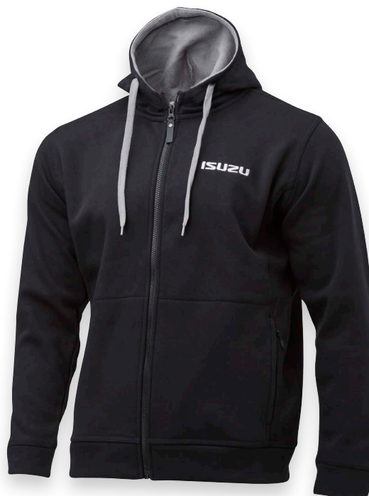
MEN'S FLEECE HOODIE IN BLACK/GREY $92ea

Available in size 8, 10, 12, 14, 16 and 18.