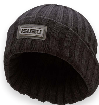
ISUZU BADGE BEANIE $30ea