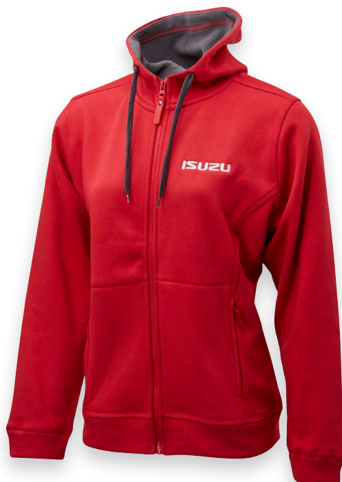
WOMEN'S FLEECE HOODIE IN RED/CHARCOAL $92ea

Available in size 8, 10, 12, 14, 16 and 18.