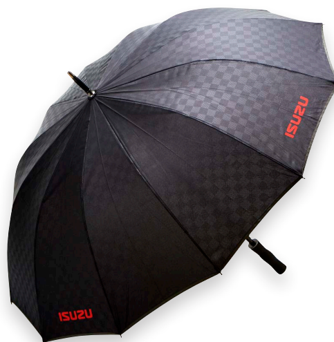
GREY CHECK BOSS UMBRELLA $90ea

Full range of Isuzu Merchandise available. Contact your local dealer for more information.