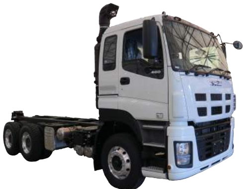
Engine Performance Curve 6WG1 TCS